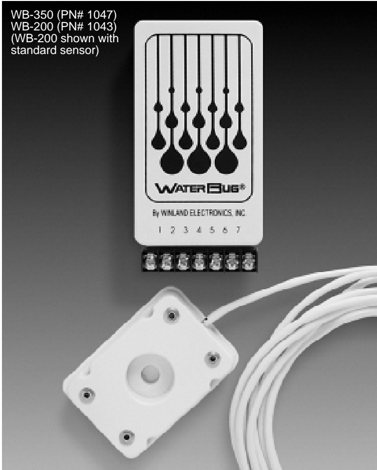
WB-350 (PN# 1047) WB-200 (PN# 1043) (WB-200 shown with standard sensor)

The WB-200 operates on 12 or 24 volts AC or DC and has a form C relay contact output that can be connected to alarm panels, bells, dialers etc. The WB-350 operates on a 9V battery and has an open collector output that will be compatible with most alarm panels or wireless transmitters. The WB-350 also has a low battery indication that will trip the open collector output and give an audible warning if battery voltage runs low. As many as six sensor probes can be run up to 100 feet away from either unit. Each sensor probe has two contacts. A film of water forming a bridge between either of these two contacts is all that is needed to trigger an alarm output. The sensor will not alarm due to condensation or high humidity. The WB-200 and the WB-350 include one standard surface sensor.