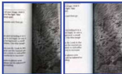
One-Way Light Source

LS-4600 provides you with fantastic experiments of large-scale images scanning, such as historical documents and data processing and guarantees superior color quality at the same time.