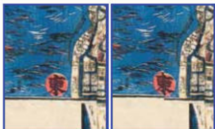
▲ No image stitching

Adopted with a high-standard optical image component, LS-4600 can capture an A0-size image by single lens, preventing occurring of errors for image stitching generated by dual lens.