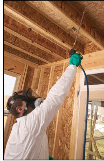
Applying Bora-Care with Mold-Care to a water-damaged home will kill existing mold and prevent mold from reoccurring. Remember, nothing can stop mold from growing if the conducive conditions are not corrected.