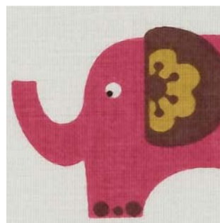
▶ After applied with the Texture Smoothing function