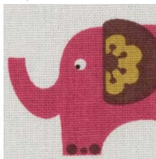
▶ Before applying with the Texture Smoothing function

This software is specifically designed for digital textiles and printings, offering many image improving functions, such as Texture Smoothing, Luminosity Sharpen and Detail Enhancement. ScanWizard DTG is good for using on printing digital patterns in textile, printing, dyeing and ready-to-wear industries.