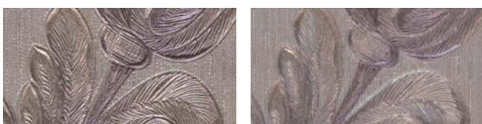
▶ One-way LED light source More stereoscopy