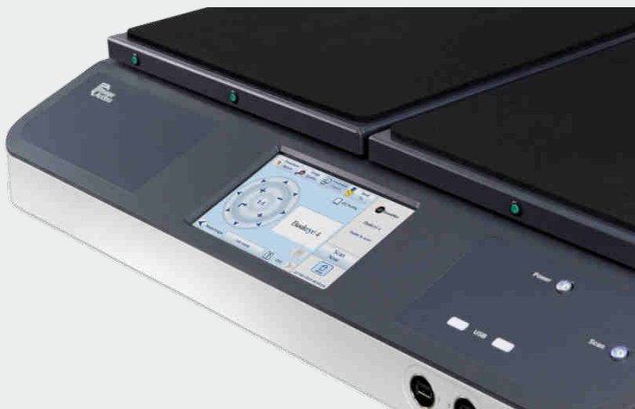
Large color touchscreen for simplified operation

If scanner requirements become more demanding over time, the Bookeye® 4 V2 Basic can be quickly and easily upgraded. This protects your investment while allowing you to add functionality, like software options or interfacing with Batch Scan Wizard or other capturing clients.