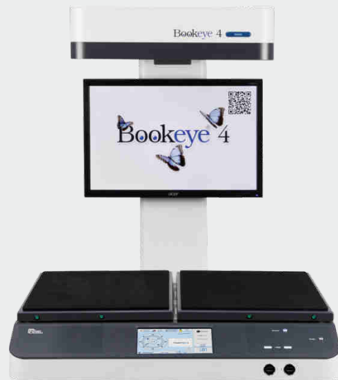
Front view of the Bookeye® 4 V2 Basic.