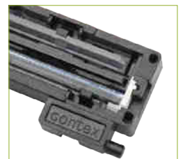
Contex CleanScan CIS