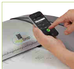
Cloud enabled with PageDrop