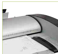
Guides for easy handling