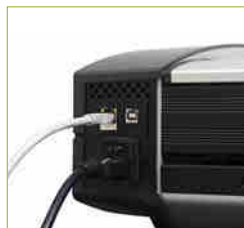
Up to 14 ips in color across corporate networks