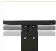
Height adjustable stand for optimal ergonomics