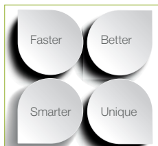
Faster in color, Better image quality, Cloud enabled, and Unique technology

IQ Quattro scanners are ideal for project workgroups . Scan documents and enhance your files in AutoCAD®, ESRI® and others. Share through cloud solution .