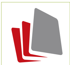
IQ Quattro is recommended for workgroup usage