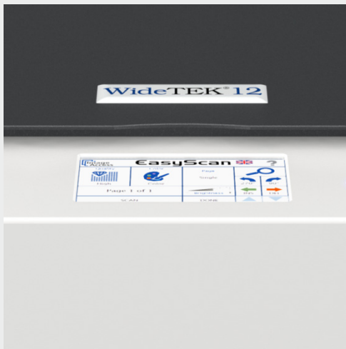
Large color touchscreen for simplified operation