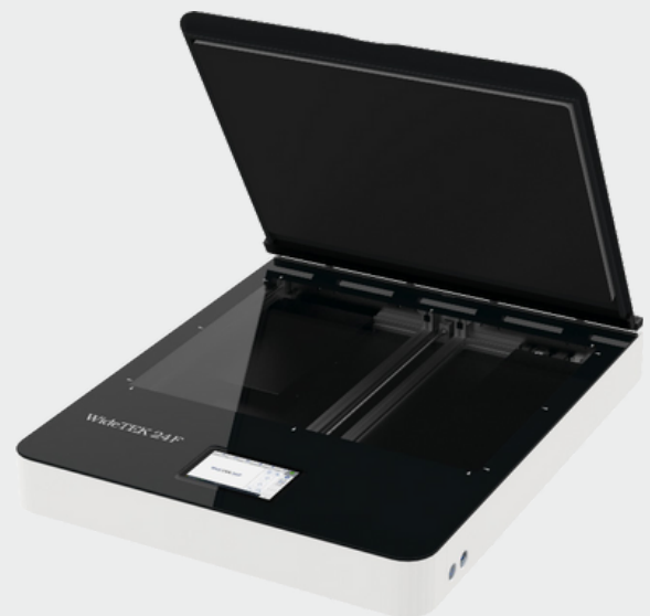
Scratch resistant glass plate enables scanning oversized originals